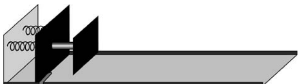
Fig. 1 The projecting apparatus