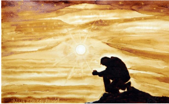
'Endurance' by Alwy Fadhel, Coffee on Paper