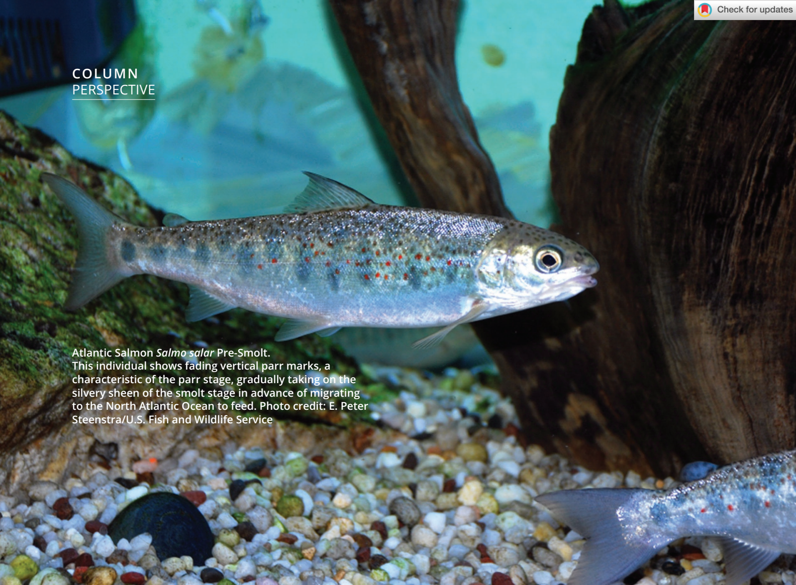
Atlantic Salmon Salmo salar Pre-Smolt. This individual shows fading vertical parr marks, a characteristic of the parr stage, gradually taking on the silvery sheen of the smolt stage in advance of migrating to the North Atlantic Ocean to feed.