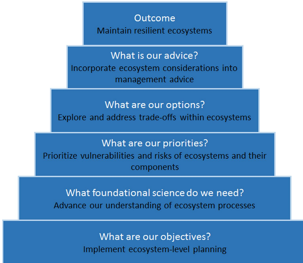
Figure 1. Illustration of the interconnected and interdependent nature of the major ecosystem-based fisheries management (EBFM) guiding principles (NMFS 2016).