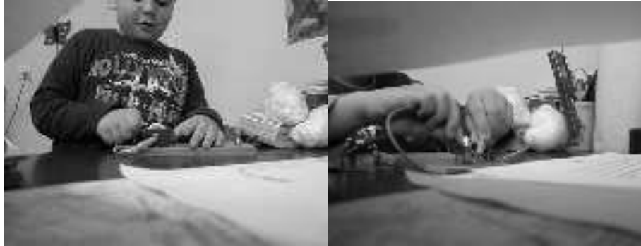
Photograph 2 Children connecting the circuit on their own

not know how to go about making the connection, and either asked, or it was suggested to them, how the connection could be made, upon which the connection was carried out by the researcher (photograph 4).