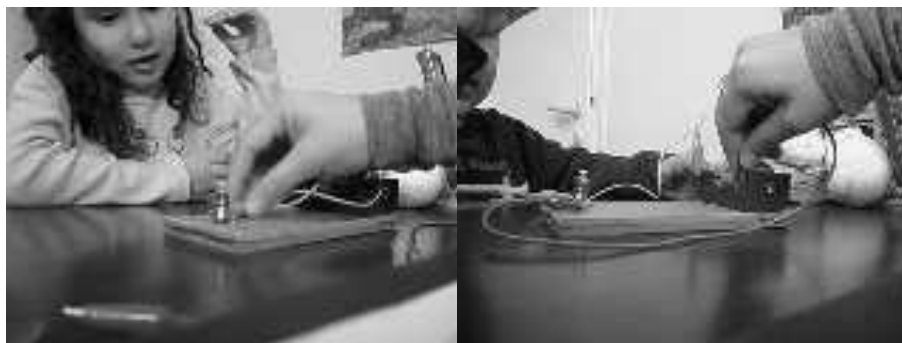
Photograph 4 Connection of the circuit by the researcher alone

Third Research Question: After the Completion of a Rudimentary Wiring, What Representations do the Children form in Regard to the Functioning of the Circuit?