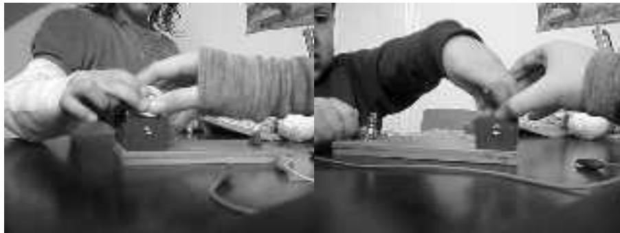
Photograph 3 Connecting the circuit with help from the researcher