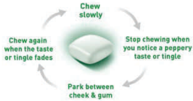
Figure 1. How to use Nicorette gum. From Nicorette: Real medicine in the form of gum , by GlaxoSmithKline Consumer Healthcare, 2008, Retrieved June 11, 2008, from http://www.nicorette.com/Nicorette_Product.aspx

While it is clear that companies, such as the producers of Nicorette, advertise and promote the use of NRT products as a successful smoking cessation strategy, it is telling that the Ontario government and organizations such as the Centre for Addiction and Mental Health (CAMH) also promote their use. This is evidenced by the Ontario government removing PST from all NRT products (CAMH, 2007a, para. 1) and by its partnering with the Centre for Addiction and Mental Health in the Smoking Treatment for Ontario Patients (STOP) program to give NRT to 13,000 smokers at no cost (CAMH, 2007b, paras. 1-2). As a result, 1,600 of these participants quit smoking, which pleased the Clinical Director of Addiction Programs, Dr. Peter Selby, who stated, “It’s clear there’s both a demand and a need for nicotine replacement therapy. With the Ontario government’s help, we’re committed to find the most effective ways to help smokers quit” (CAMH, 2007b, paras. 4-5). Corporations, organizations, and the provincial government agree that NRT products are useful in helping Ontarians successfully kick the habit.