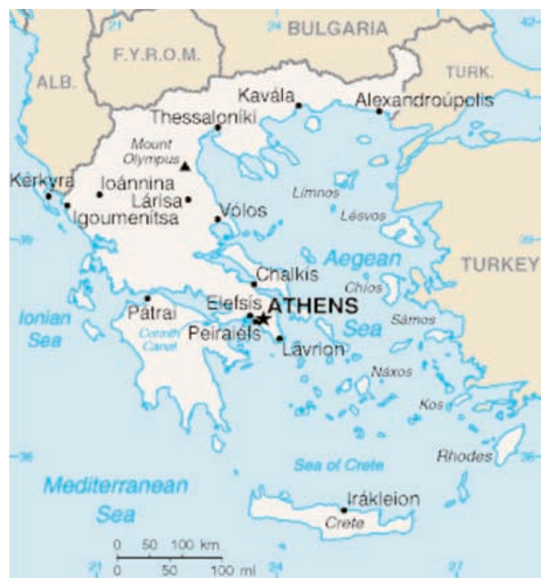
Map of Greece. CIA World Factbook.