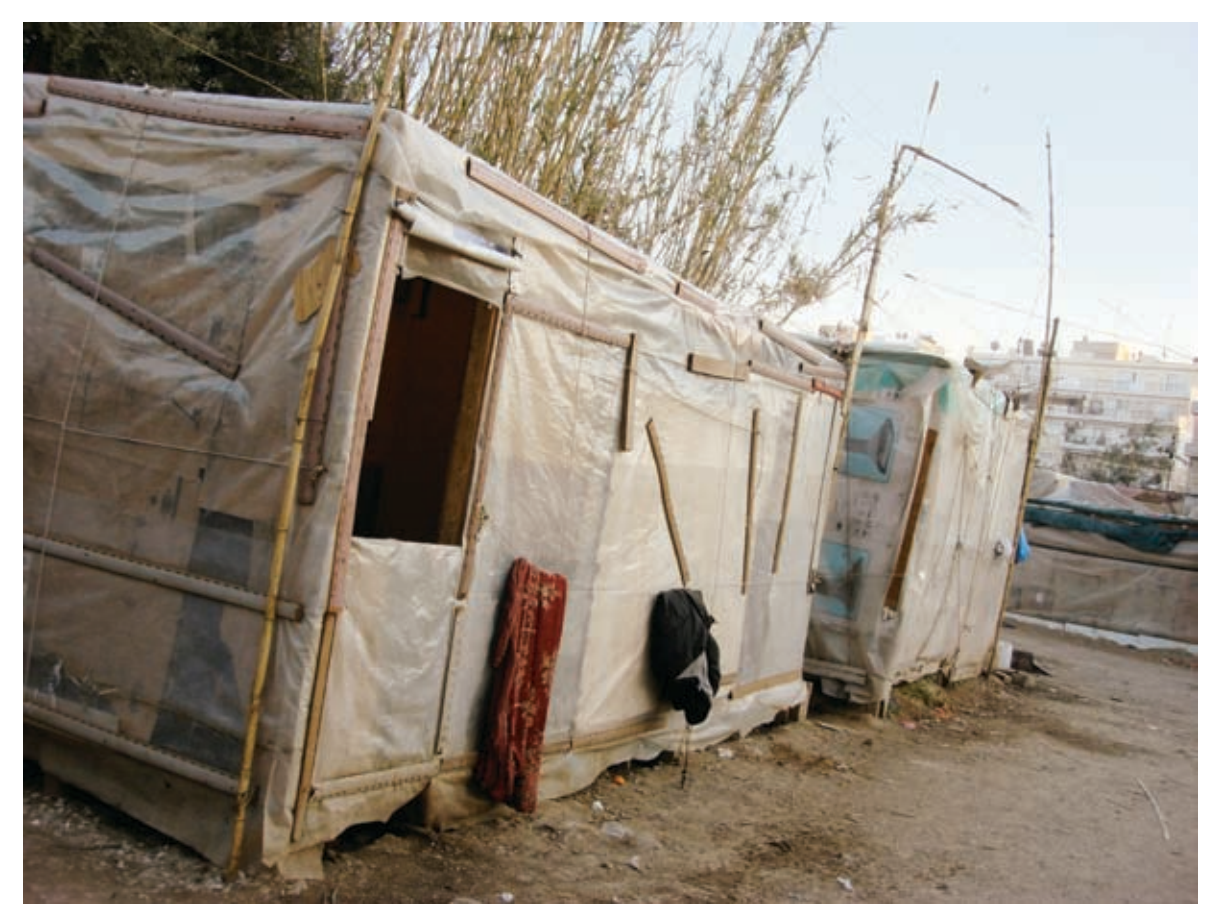
The Camp of Afghan refugees in Patra.