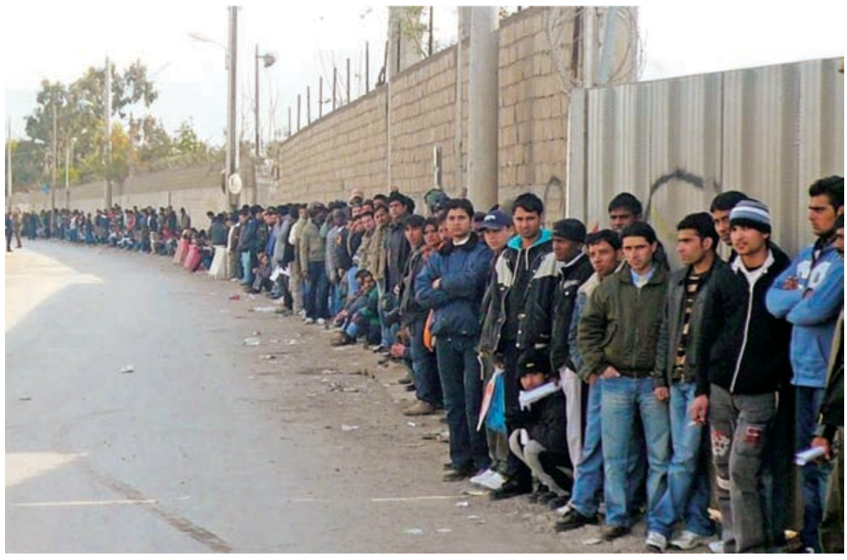
Athens, Attica Police Asylum Department (Petrou Ralli): Hundreds of asylum seekers standing in line waiting to lodge their asylum applications.

The right to claim asylum is stated in the Universal Declaration of Human Rights, Article 14. Also the EU Procedure Directive obliges the Member States to guarantee access to asylum procedure, cf. art. 6.